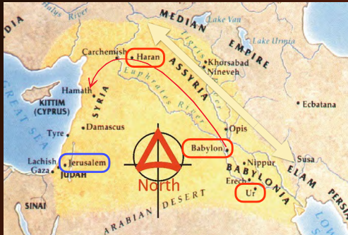
The King of the North, the King of Babylon.

Dan 1:1 ...In the third year of the reign of Jehoiakim king of Judah, (605bc) Nebuchadnezzar king of Babylon came to Jerusalem and besieged it.