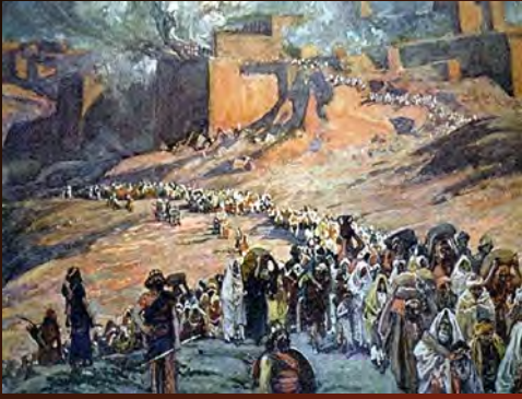
In 605 bc, Nebuchadnezzar captures Jerusalem. ...the Lord gave Jehoiakim king of Judah into his hand. Dan 1:2

In captivity God returned the children of Israel, to the ancestral land of Abraham. A land He had deemed unclean, a land He had asked Abram to leave.