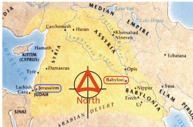
Nebuchadnezzar King of Babylon was called the King of the North.

Between Jerusalem and Babylon is, the Arabian Desert.